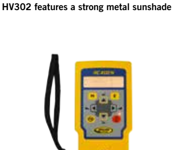
RC402N Radio Remote Control for all applications